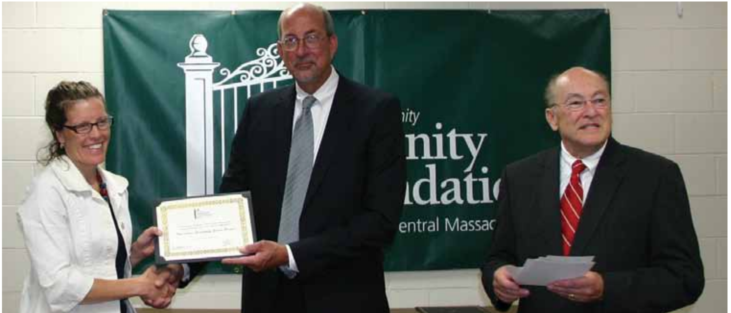
The Trustees of Reservations will create a new community garden on Lindell Avenue, Leominster. The $12,500 grant for the Twin Cities Community Garden Project will be used in collaboration with the Boys & Girls Club of North Central Massachusetts.

$21 Million in grants and distributions have been made since our inception.