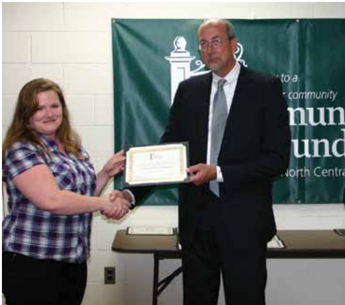
Gardner Group, Inc. will use its $20,000 grant to update its Westminster facility to meet current building codes. The non-profit agency provides "line-of-fire" services to help restore first responders coping abilities, energy level and commitment to their work. In addition, they offer programs dealing with substance abuse, as well as stress management, through training, counseling, educational and family support services.