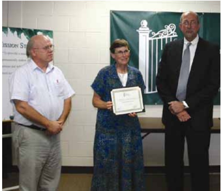
Mount Grace Land Conservation Trust, Inc. received an $8,800 grant for its Service Learning Project, which will provide young people with skills and hands-on service learning opportunities that will improve recreational trails, signage for trails and protection of vernal pools. The Athol town manager, Orange town administrator, North Quabbin Chamber of Commerce and numerous other organizations are collaborating on the initiative.