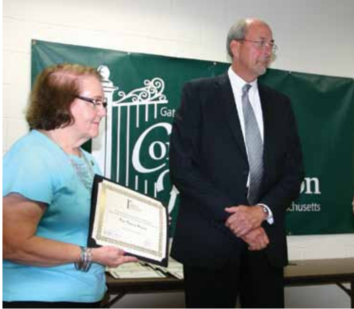
Literacy Volunteers of the Montachusett Area received $4,000 for its Tutor Training Program. It will conduct four 18-hour tutor trainings, and provide books and materials to use when teaching. Having more trained tutors will allow 40 individuals on the waiting list to receive services.