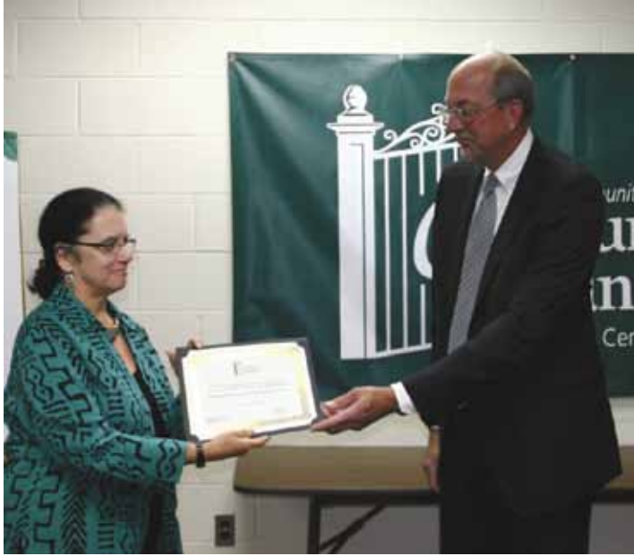
Nashua River Watershed Association's grant of $14,350 will help control purple loosestrife along the Nashua River. The goal is to reduce loosestrife by 20 percent in two years and 80 percent in 10 years, enabling the re-establishment of native plants along the river in Clinton, Fitchburg, Littleton, Shirley and Westminster.