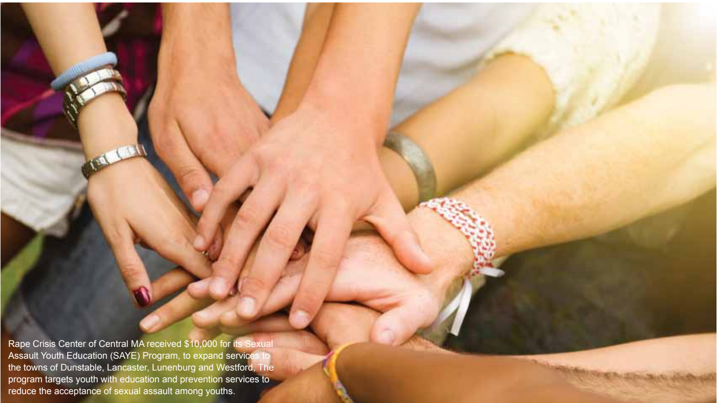
Rape Crisis Center of Central MA received $10,000 for its Sexual Assault Youth Education (SAYE) Program, to expand services to the towns of Dunstable, Lancaster, Lunenburg and Westford. The program targets youth with education and prevention services to reduce the acceptance of sexual assault among youths.