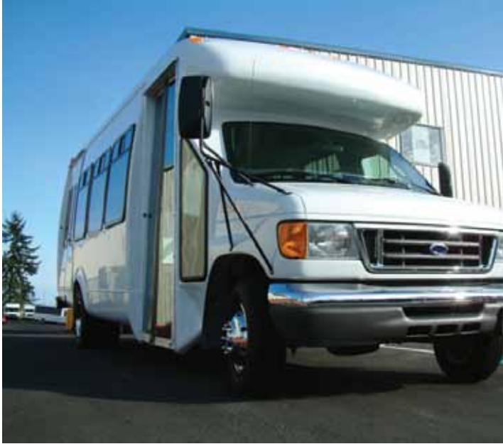
A $6,500 grant to the Shirley Council on Aging will allow it to expand its medical transportation program and provide seniors with greater access to healthcare options.