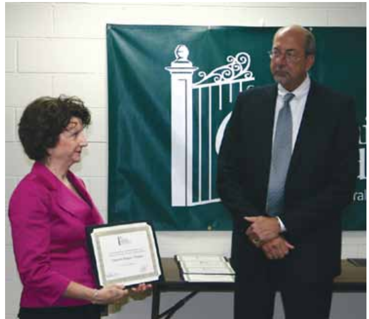
The Horizons for Homeless Children, which provides services for homeless children, is refurbishing a play space in Leominster through a $3,250 grant, in addition to replenishing supplies at all three of its sites. They will also use some of the funds to recruit and train more volunteers.