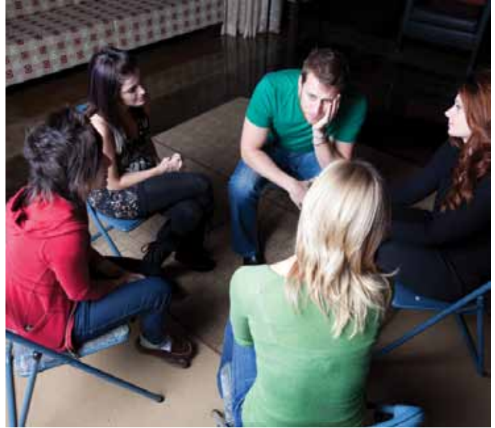
L.U.K. Crisis Center, Inc., Fitchburg received an $18,000 grant for the Youth Partnering for Recovery (YPR) Project, serving 20 youths in the Nashoba Valley region needing assistance with substance abuse and coexisting mental health issues.