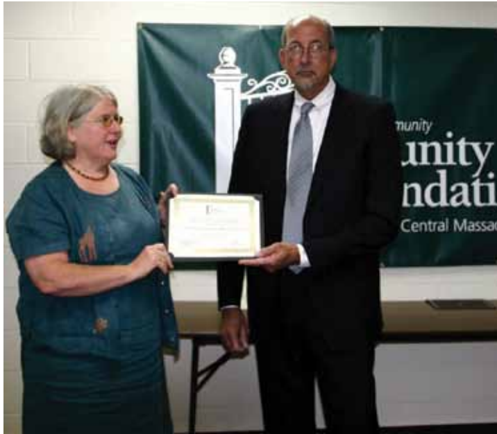
The United Arc of Franklin and Hampshire Counties, Inc. is launching a Positive Parenting Program – North Quabbin Services – with its $20,000 grant, which will provide a series of parent education and support groups for parents with intellectual disabilities or functional limitations.