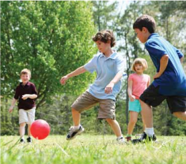
Doctor Franklin Perkins School of Lancaster will use its $10,000 grant for the Kid Fit Healthy Lifestyle Community Project, designed to improve the physical and mental health, physical fitness level and leisure skills of children.