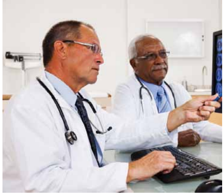
A $15,000 grant to the Friends of Nashoba Valley, a group that supports Nashoba Valley Medical Center, will be used to purchase a teleneurological camera, in order to provide high quality 24/7 access to consult and assess patients with neurology symptoms.