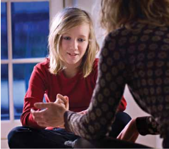
Helping address substance abuse, mental health professionals will deliver a structured, preventative message about alcohol and substance abuse to those who have not yet used illicit substances, through a $9,276 grant to the Lowell House Inc.'s Darby Fassett Project, "Be the One."