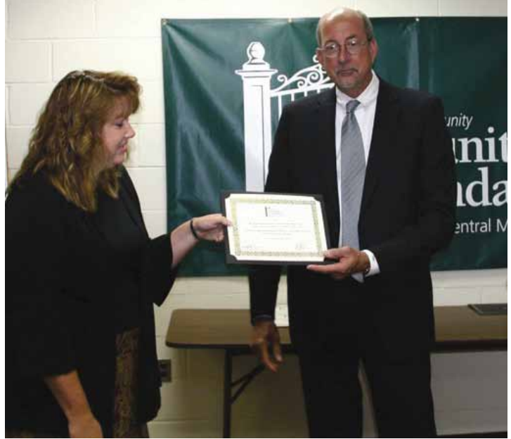
Our Father's House, Inc., which currently provides overnight shelter only, will use a $19,000 grant to remain open three days a week, providing therapeutic self-help to the homeless. By opening the shelter during the day, even on a limited basis, clients will have a safe indoor location away from harsh weather, as well as the benefit of increased support from the group sessions.